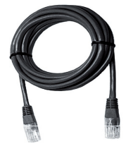
Ethernet Cable ** (supplied with AP110 and AP210)

*Box contents may vary for replacement/swaps, **Ethernet cables are optional depending upon terminal model and order configuration