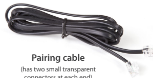
Pairing cable (has two small transparent connectors at each end)