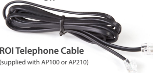
ROI Telephone Cable (supplied with AP100 or AP210)