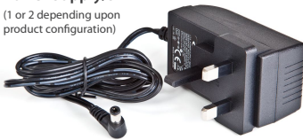
Power Supply/s (1 or 2 depending upon product configuration)