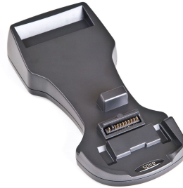
D4200 Charging Dock (supplied as standard with some product configurations only; for charging the handset and pairing the Handset with its Access Point)