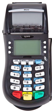
M4240 Handset (New terminals include a pre-fitted battery)